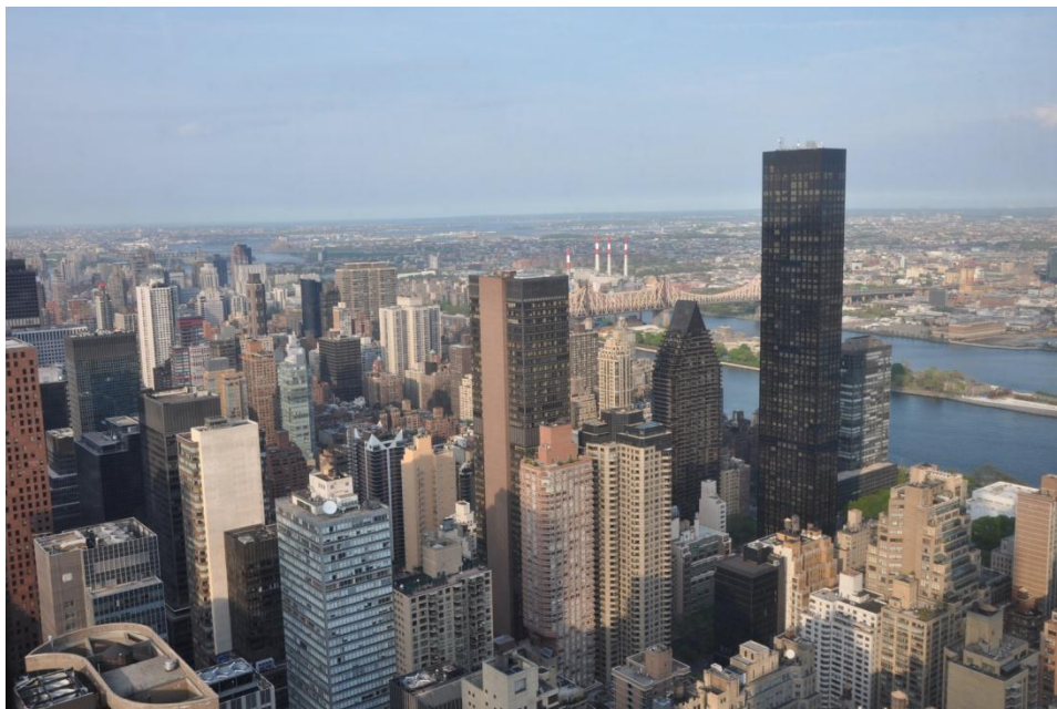
OAs met on the 67 th floor of the Chrysler Building in New York