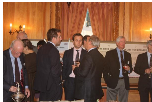
Informal business networking

To keep up with Karren, visit her website http://www.karrenbrady.com/