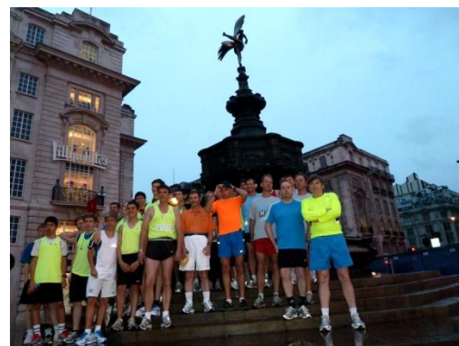
Piccadilly July 2011

If you are unable to read this e-Newsletter you will also find it at