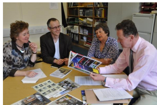
ALDENHAMIANA – Editorial team