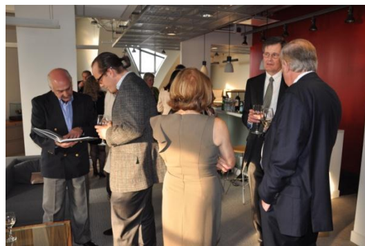
Swapping stories and catching up