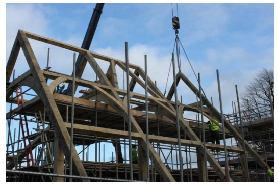
The green oak frame – Have you sponsored a beam yet?

OAs that are interested in participating in this new initiative, either as a Mentor