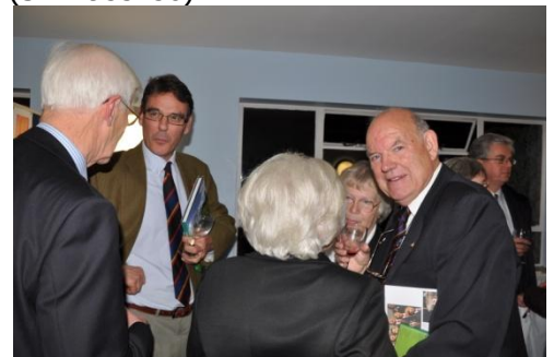
Friends re-unite at a reception for subscribers to the History Book.