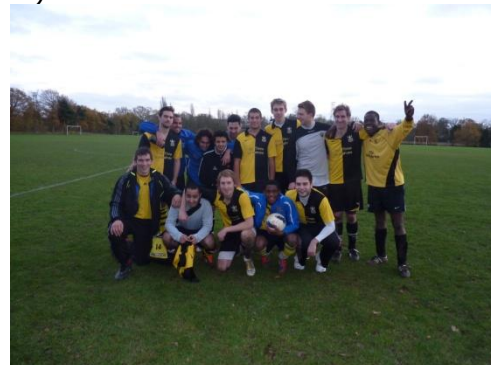
A Winning Team – Arthur Dunn Cup Replay against Old Chigwellians, Saturday 3 rd December '11.