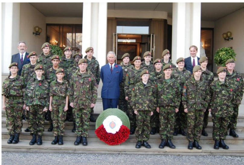
CCF cadets with HRH Prince Charles outside Wellington Barracks before marching to the Cenotaph on Remembrance Sunday.