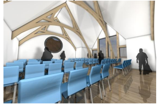
Purlins £450, King posts £1,200, Tie Beams £5,000 (less tax if Gift Aided).