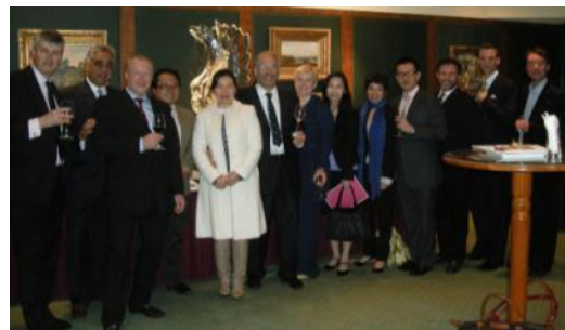
The Headmaster with OAs and Parents in Hong Kong