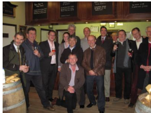
Aldenham.net - Tring Brewery 3 rd March 2011