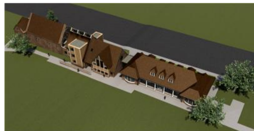
The proposed Sixth Form Centre and Music School Extension

One of the benefits of membership of the OA Society is the receipt of Aldenhamiana , the annual newsletter of OA Society. The October 2010 edition of Aldenhamiana was inadvertently sent to 800 non members who do not normally receive it. If you were one of the 800, the OA Office would like to hear from you. Did you enjoy receiving Aldenhamiana ? Would you like to receive it again?